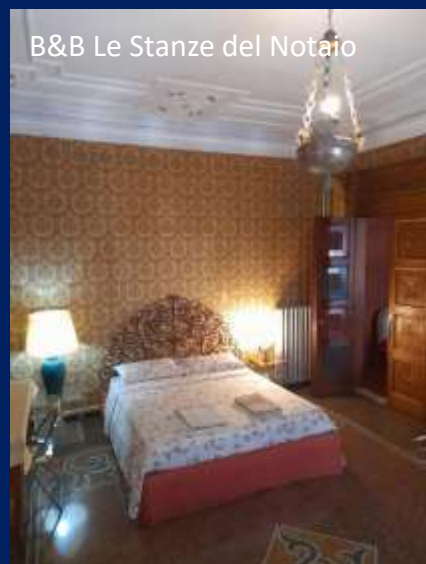
B&B Le Stanze del Notaio

Contact us info@centurini.it for accommodation support service